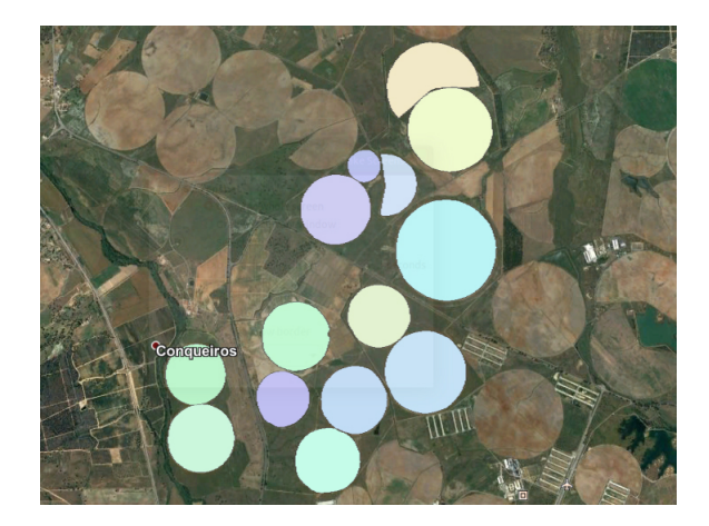
Figure 1: Google view images of 14 parcels

parcels are from Alentejo region with coordinates between (37°56'29.13" N , 8°22'21.95" W) and (37°55'32.44" N, 8°21'02.23" W). Figure 1 shows the Google View image of these 14 parcels. EC value was measured at 10-meter intervals resulting in a total of 65003 points.